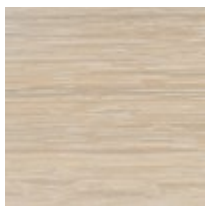
Sun Drenched Oak

An updated take on the classic canopy bed, Pinstripe Light reimagines a beloved Caracole style in a fresh material mix. With a canopy and posts framed in Sundrenched quarter sawn oak, its architectural design is emphasized by cascading vertical slats in a creamy Almond Milk finish. Metal post brackets in Champagne Gold add a jewelry-like finishing touch.