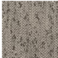
1-18''' x 18''' Pillow 8262-95CC