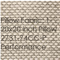
Pillow Fabric: 1-20x20 inch Pillow 2731-74CC-P Performance