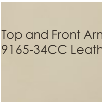
Top and Front Arm 9165-34CC Leather