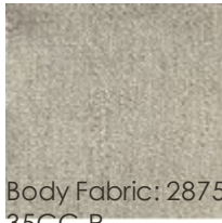
Body Fabric: 2875- 35CC-P Performance, Decorative Trim on Frame U00461