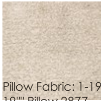
Pillow Fabric: 1-19''' x 19''' Pillow 2877- 92CC