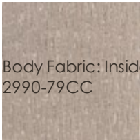
Body Fabric: Inside 2990-79CC