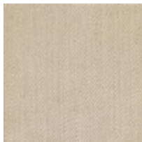
Body Fabric: 2321-87CC