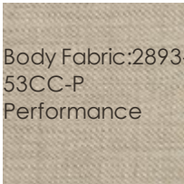
Body Fabric:2893-53CC-P Performance