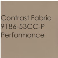
Contrast Fabric 9186-53CC-P Performance