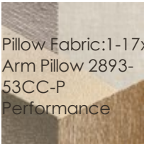
Pillow Fabric:1-17x29 Arm Pillow 2893-53CC-P Performance