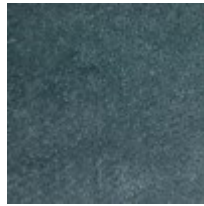
2-20''' x 20''' Pillows 2285-52CC