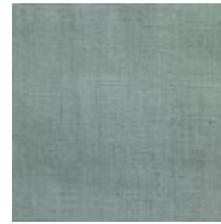
1-20''' x 20''' Pillow 2153-52CC