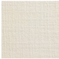
Body Fabric: 2284-86CC